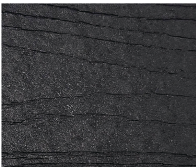
Wood Grain Texture

Additional costs and lead time apply—an embossed wood grain modification to the standard texture after the precast process. This texture is only available for up to 12" broad profiles. Embossment depth may vary due to product tolerances. It is not recommended for high-use applications. This texture is for mid to low-use residential stairs, landings, and decks.