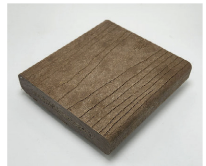
Wood Grain Texture